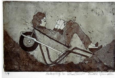
Relax in Wheelbarrow