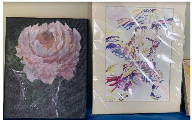
NOAA Members' Original Paintings for the Holiday Gift Exchange