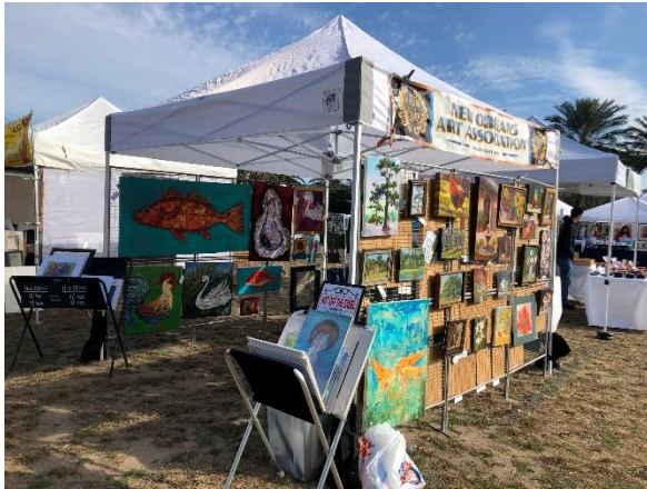
NOAA's Booth December Art Market in City Park