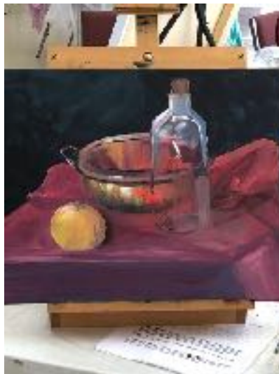
To the left: Jane Brown’s still-life workshop piece.

All works of art utilized Larisa’s color palette—not a lot of colors, but it is amazing the dynamic colors you can mix.