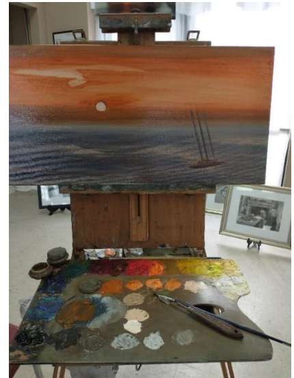
The partially finished oil painting with palette below