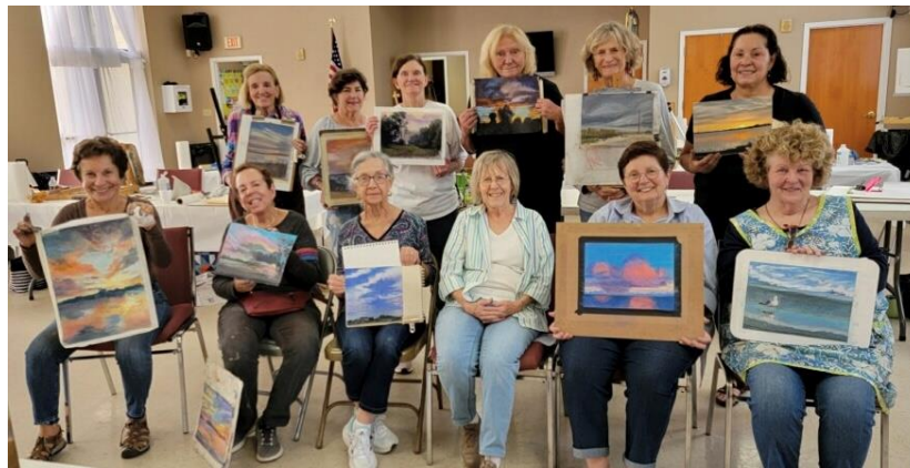
Workshop participants holding their finished pan pastel paintings