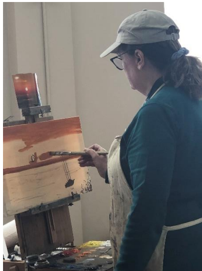
The Blocking-in stage