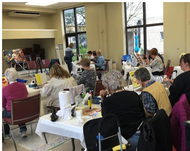
January's workshop participants, working hard and having fun!