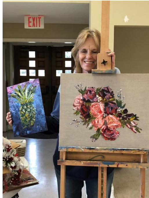
Palette Knife paintings by Beverly Boulet