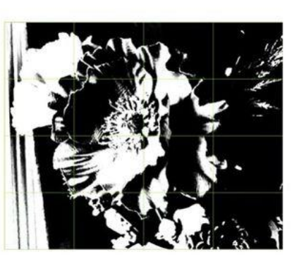
A Notan sketch showing the basic values in black and white

If your <u>Notan makes a strong</u> <u>statement with good design AND</u> <u>you stick to the Notan</u> when adding color/paint, you will have a good painting. Smart Phone App: "Grid Painter"