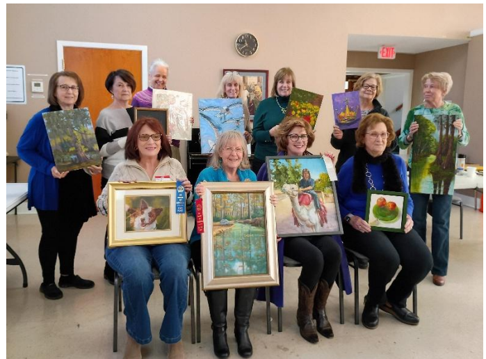
The participants for January's Artist of the Month Competition with their paintings