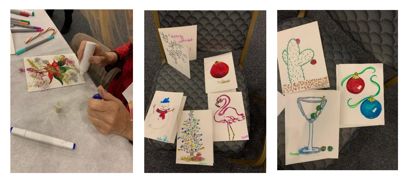
Making Christmas Cards