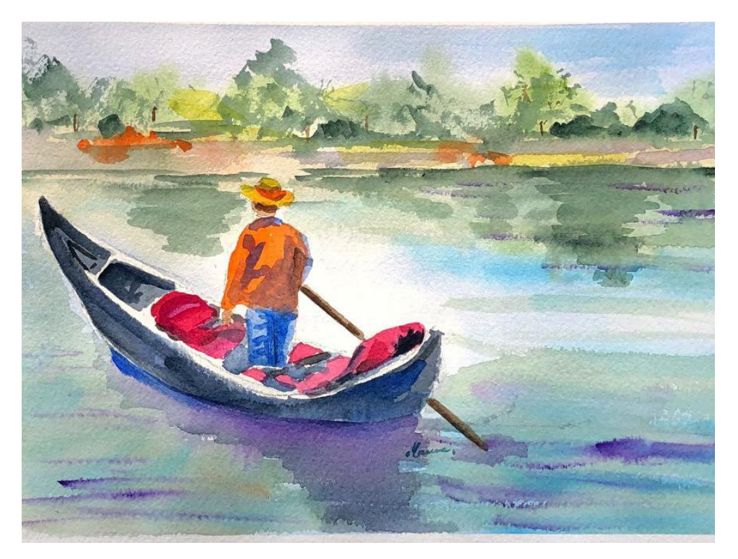
City Park Gondolier no. 2 by Marina Reed

The theme is City Park , so call your fellow artists to meet at the park for some plein air, or find your best City Park photographs, and start painting!