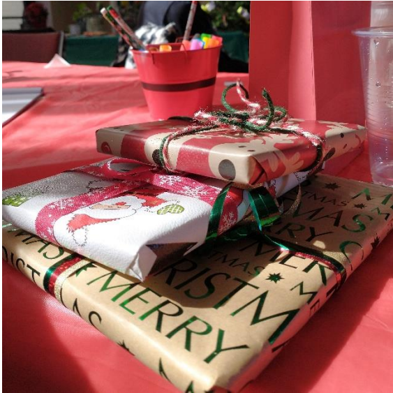
Wrapped blank canvases were given away during the 50/50 drawing.

As always, great fun was had by all. The party included a 50/50 drawing with extra giveaways, an art challenge with markers, a gift exchange of original paintings, and plenty of excellent food and wine!