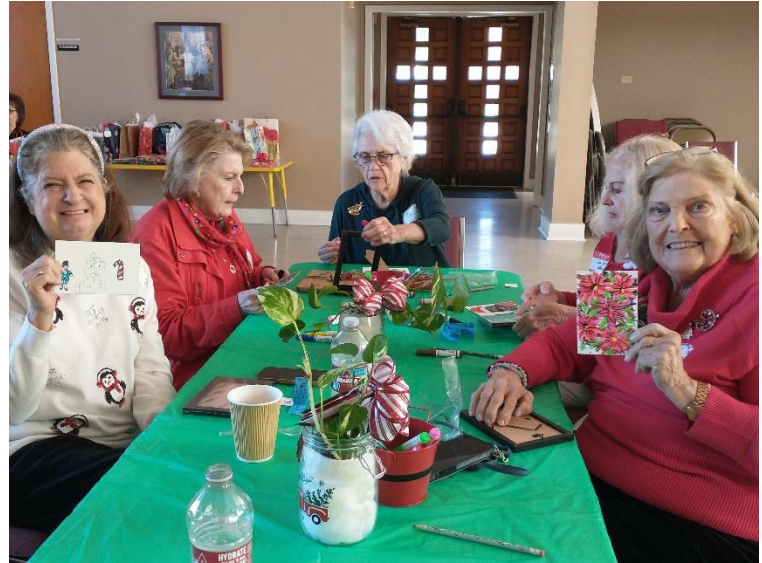
Members holding up their creations after a fun drawing exercise.