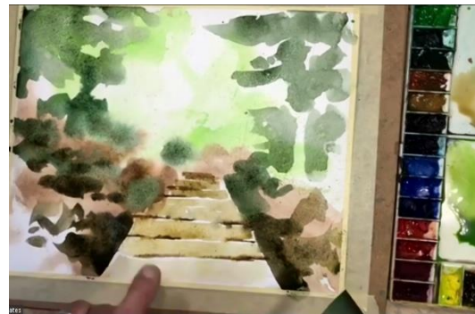
Putting in the Boardwalk