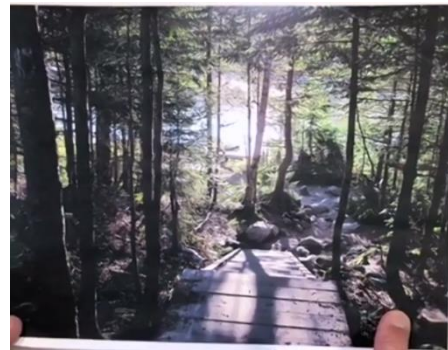
Larry's Reference Photo