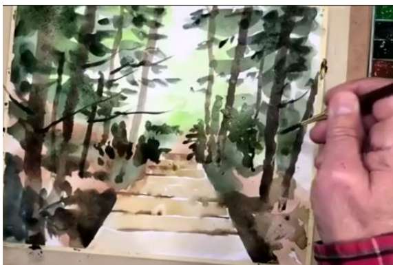
Adding More Trees