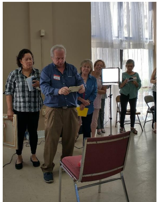
Right: Helping NOAA members photograph paintings with their cellphones.