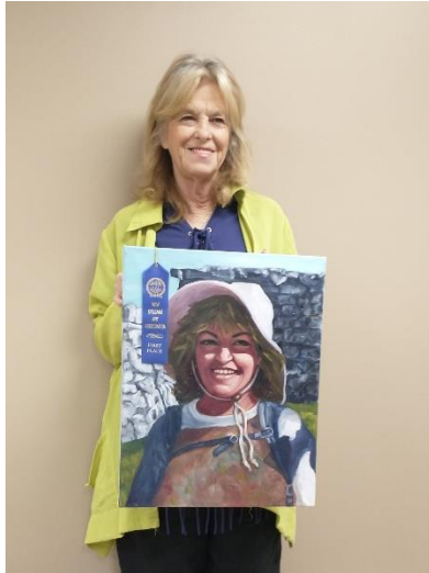
Beverly Boulet for her wonderful oil painting, "El at Talum"