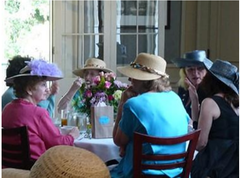
NOAA Members in their spring hats at a previous luncheon

We do not meet during the summer months, so we will see you in the fall. Our fall meeting will be on September 21, 2023 .