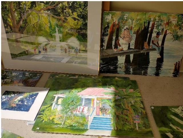
A selection of Kathy's beautiful paintings