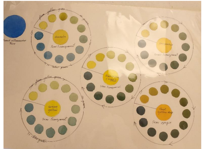
A color chart for mixing greens