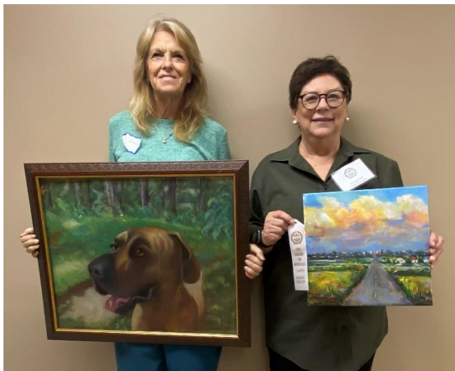
Beverly Boulet for "Bucephalus", pastel Patt Lemarie with "Hwy 51", acrylic