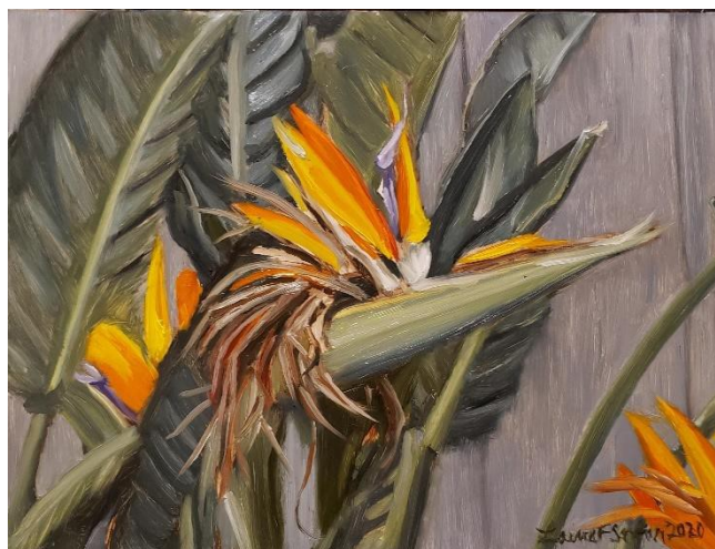
Birds of Paradise by Laura Saxon