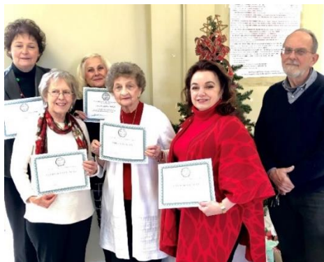
NOAA Signature Members, Dec. 2019

NOAA Meetings are held on the third Thursdays of every month from September through April, at 10:00 am. A Spring Luncheon is held in May to install officers.