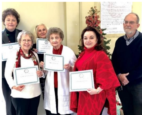
NOAA Signature Members

NOAA Meetings are held on the third Thursdays of every month from September through April, at 10:00 am. A Spring Luncheon is held in May to install officers.